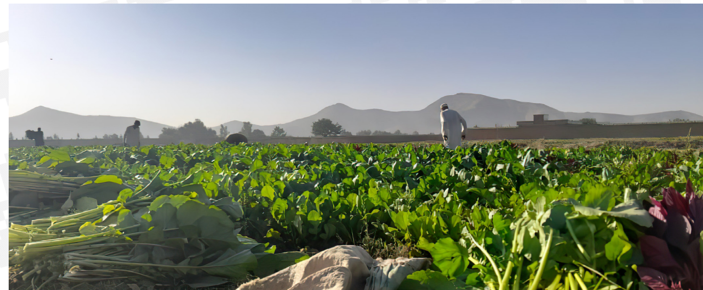
Photo: Permaculture Farm, initiated by Mahboba's Promise and funded in conjunction with Muslim Aid Australia

The program aims to strengthen the connection between widows and orphans and the environment.