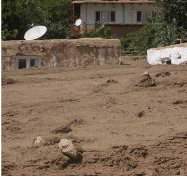
Damage caused by flood waters in Pushgoor Village.

Winter is arriving and the men are living in tents, still waiting for the promised money. Going forward, I promised them we'd support their Girls High School in as many ways as possible.