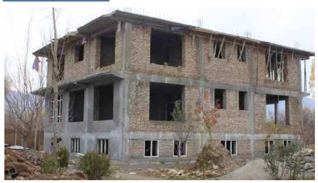
Recent photo of Badakhshan Hope House construction progress.

Building the new Hope House in Badakhshan Province has been our biggest project this year. I am delighted to report that the construction phase is complete. Window fittings have started and the remaining work such as tiling, wiring and furnishing should be completed in a couple of months and I anticipate that the children will move to their new home in early spring (northern hemisphere), when it is a bit warmer.